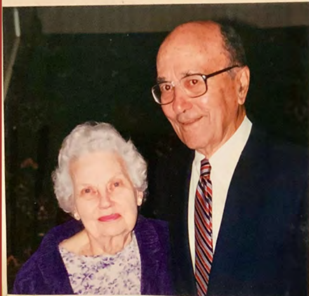
Sept 16, 2000 T. F. A. - Fort Wayne, IN