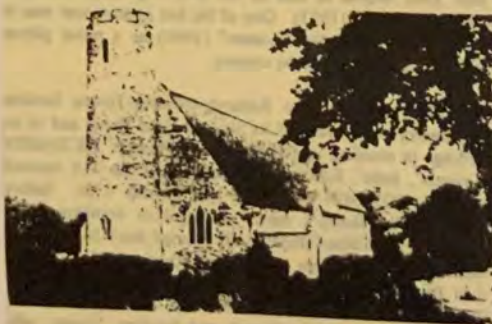
St. Mary the Virgin, Blundeston